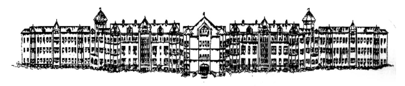
Illustration of Patton State Hospital Circa 1902 Based on a Lithograph by Vern Fowler

Patton State Hospital has provided mental health treatment since 1893 and has been accredited as a forensic mental health facility by the Joint Commission on Accreditation of Healthcare Organizations (JCAHO) since 1987. It is the largest maximum-security forensic hospital in the